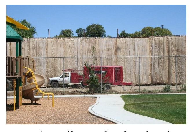
2. A 16-foot sound barrier similar to the one shown above will be erected next to the work site.

respectful at all times. Please note that, after the well is drilled, all work to complete the well testing, site cleanup and demobilization will occur between 7:00 a.m. to 7:00 p.m.